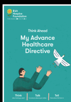
Think Ahead Advance Healthcare Directive